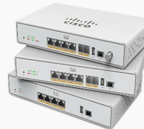
CGP-ONT-4PVC CGP-ONT-4PV CGP-ONT-4P